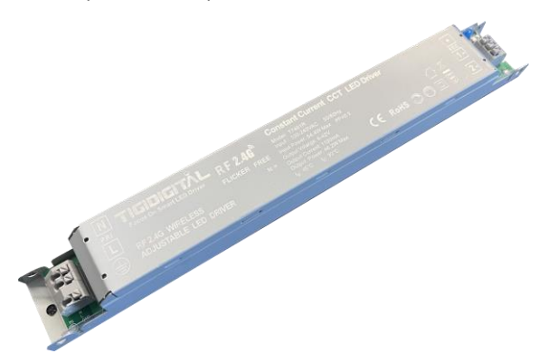
T7461R (Iron housing)